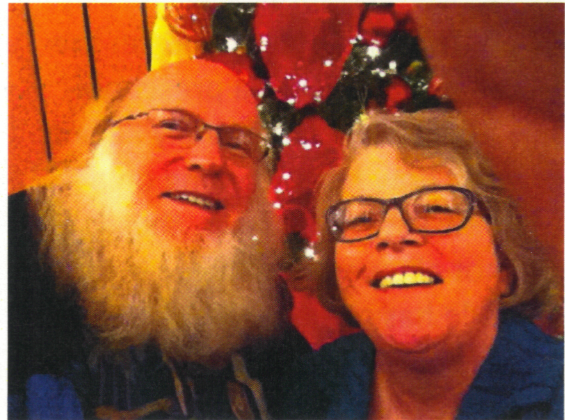
In front of one of the Christmas trees in Nashville